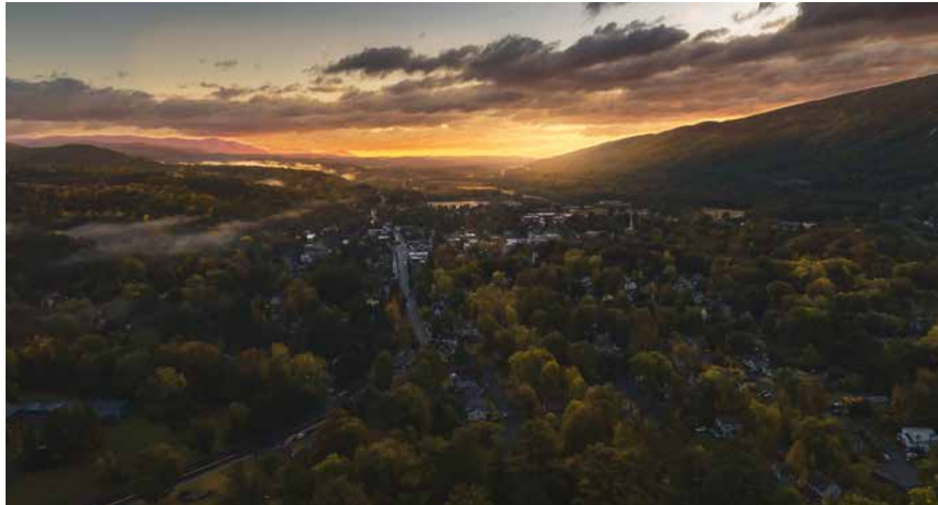
Ellenville, NY.