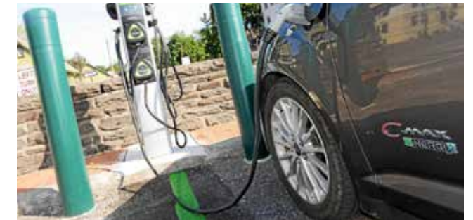
EV Charging station at the Ulster County Office Building. Daily Freeman