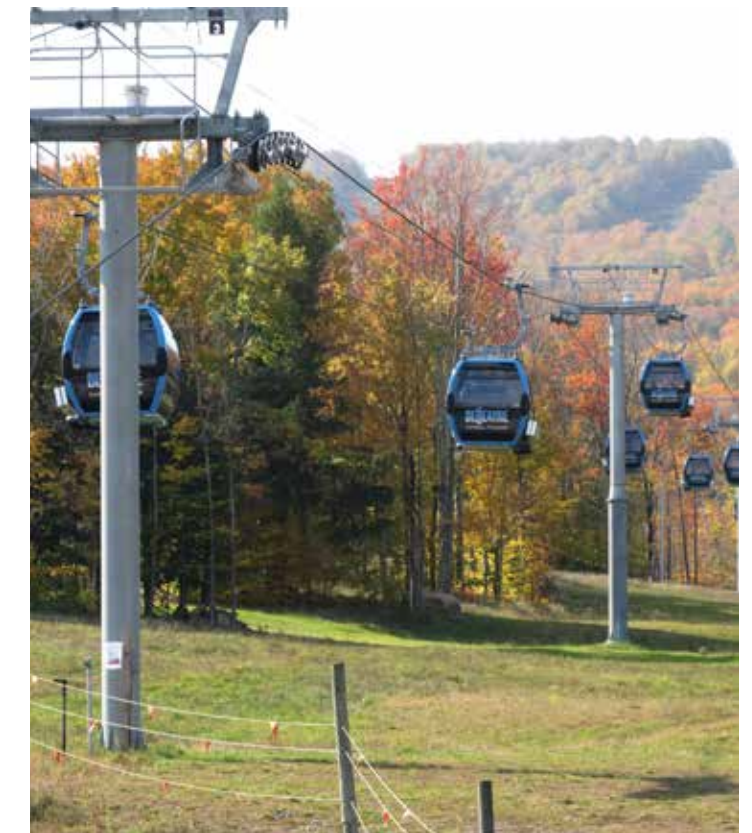
Ski lifts at Belleayre Mountain Ski Center, Highmount, NY.