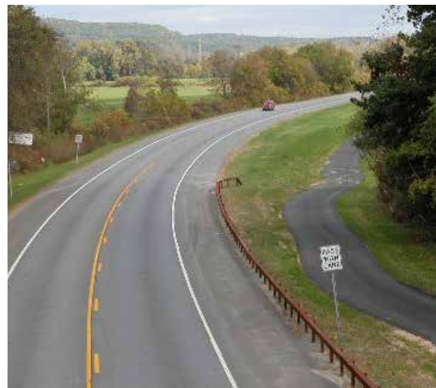
Route 209, Hurley, NY.