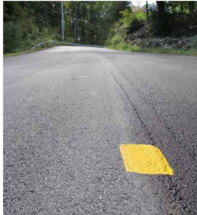
Recent paving of a road in Ulster County.