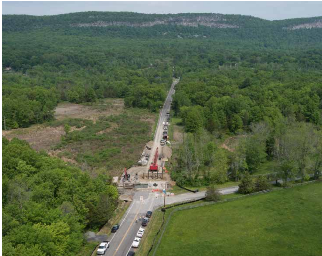
Critical Bridge Over Water Program bridge replacement on Rtes 44/55, Town of Gardiner.

The goal-driven approach to recommended projects, actions, and programs when combined with the fiscal analysis demonstrates UCTC's commitment and capability to maintain and operate the regional multimodal transportation system. As noted in the determination of needs, UCTC is committed to an affordable transportation system. As a result, the recommended plan does not include construction of new facilities that will add to the maintenance burden of local governments or NYSDOT. Any new facilities of significant stature and complexity would need to be financed through discretionary funds (such as the Federal Better Utilizing Investments to Leverage Development (BUILD) program) and/or new, public/private sources. The multicounty asset management preservation program that NYSDOT Region 8 used to direct funding to pavement, bridge, and ancillary asset needs provides a methodology for meeting the infrastructure preservation needs of the State highway system.