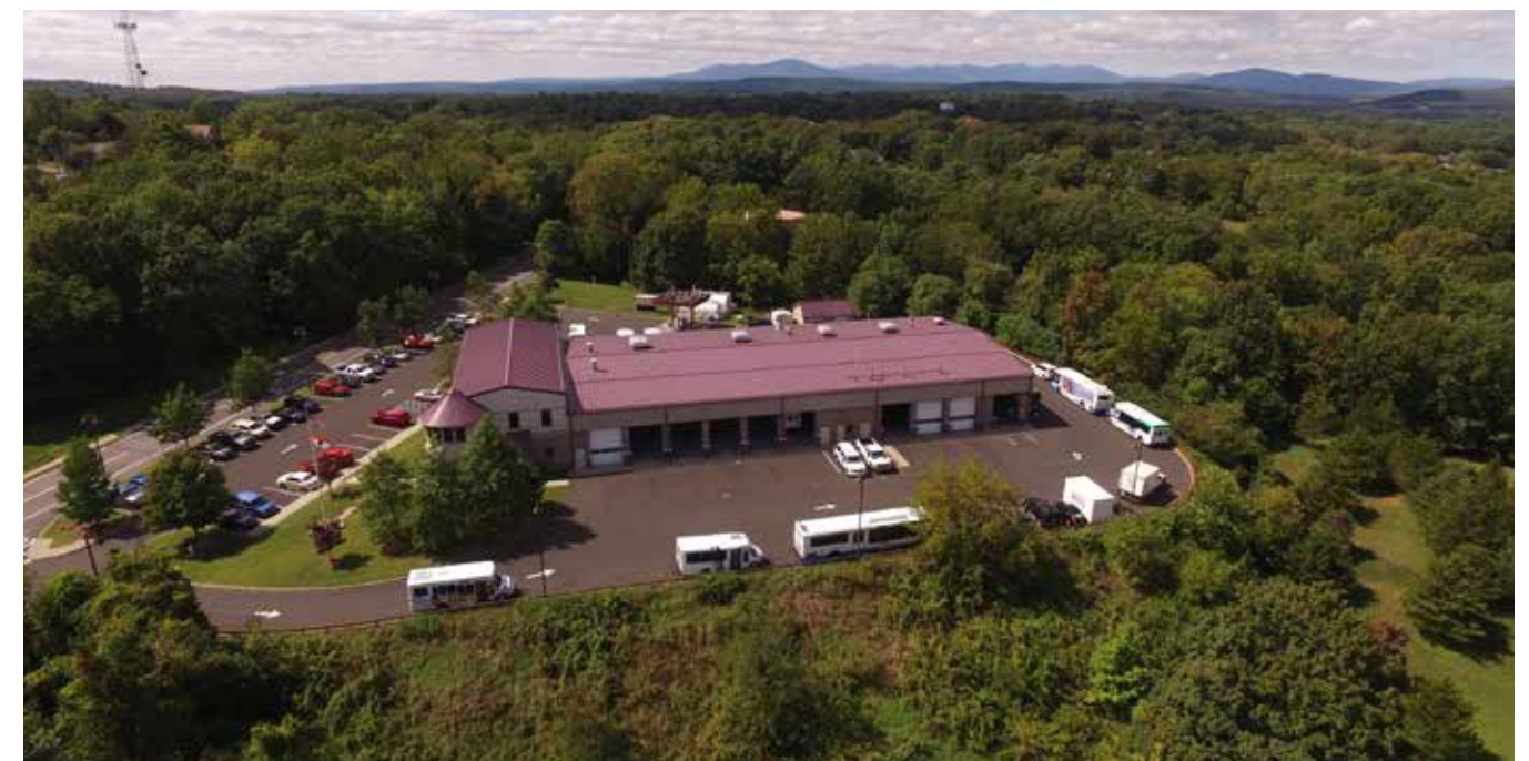
Aerial view of the Ulster County Area Transit (UCAT) Building.