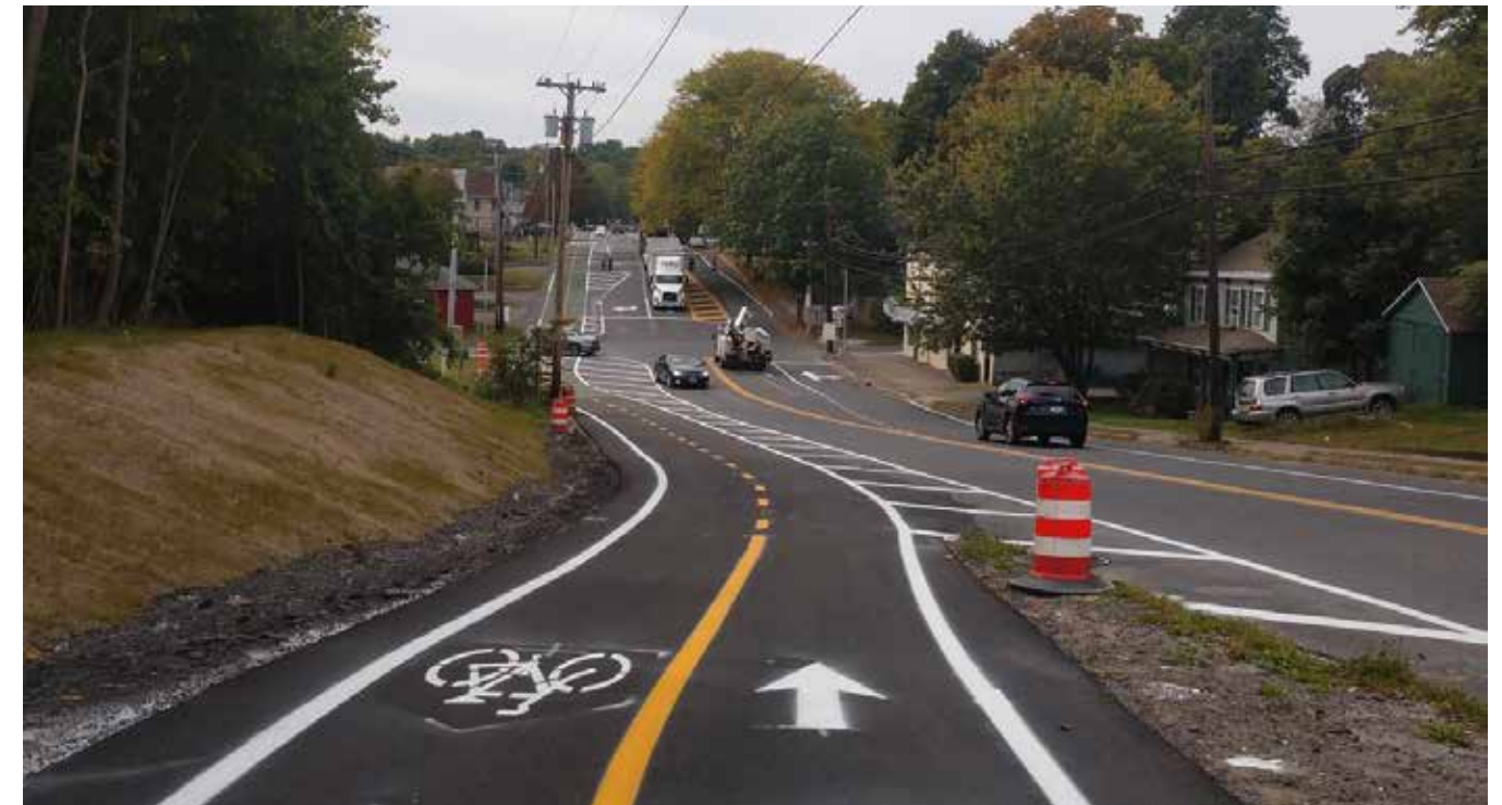
Empire State Trail