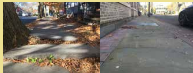
Typical bluestone sidewalks in Kingston: ADA compliant vs. Non-compliant.