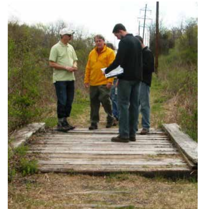
Engineering consultants conduct a site visit with U.C. Planning staff and Community Advisory Committee.