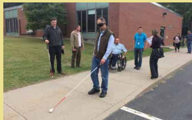
Municipal staff use wheelchairs and other devices to learn about the difficulties people with disabilities have while navigating the built environment.