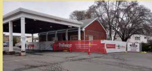
UCTC helped secure FTA funds to assist Trailways with making their Kingston bus facility ADA compliant.

UCTC has embarked on a multi-year effort to encourage and assist Ulster County municipalities with meeting compliance with the Americans with Disabilities Act (ADA), a civil rights law prohibiting discrimination based on someone's disability. In 2016 UCTC partnered with its FHWA regional representative to provide a day long training to over 30 municipal staff on key issues pertaining to ADA compliance. The focus of the training was centered on the details of the law and the design and maintenance of pedestrian facilities (sidewalks, curb ramps, and other related features) that accommodate persons with disabilities in the public right-of-way. Municipalities are required to have a plan to make accommodations for everyone, commonly referred to as an ADA Transition Plan. To encourage Transition Plan initiation and completion, UCTC staff, working with New York State Association of Metropolitan Planning Organization guidance, digitized sidewalks in each municipality and assessed their condition. The information was compiled through a geographic information system and made available for download by each municipality.