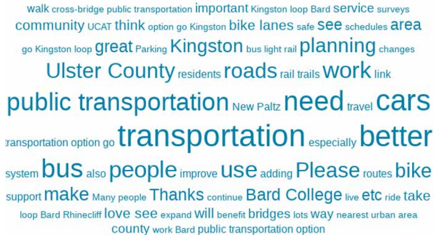
Word cloud produced from over 350 of the UCTC survey responses received in the summer of 2020.

The survey (both English and Spanish versions) was unveiled on July 13, 2020 and remained open through August 4, 2020. A total of 365 people responded to the survey, with 364 responses to the English survey and one response to the Spanish survey. The responses show that a large majority (84.9%) of the respondents live or live and work in Ulster County, indicating that the survey successfully reached its targeted audience.