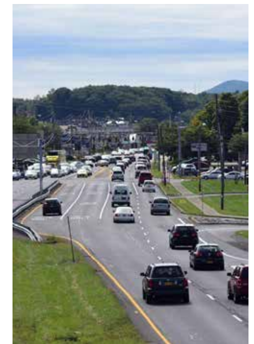
Route 9W in the Town of Ulster