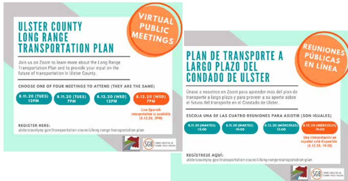
UCTC LRTP Public Meeting Flyer