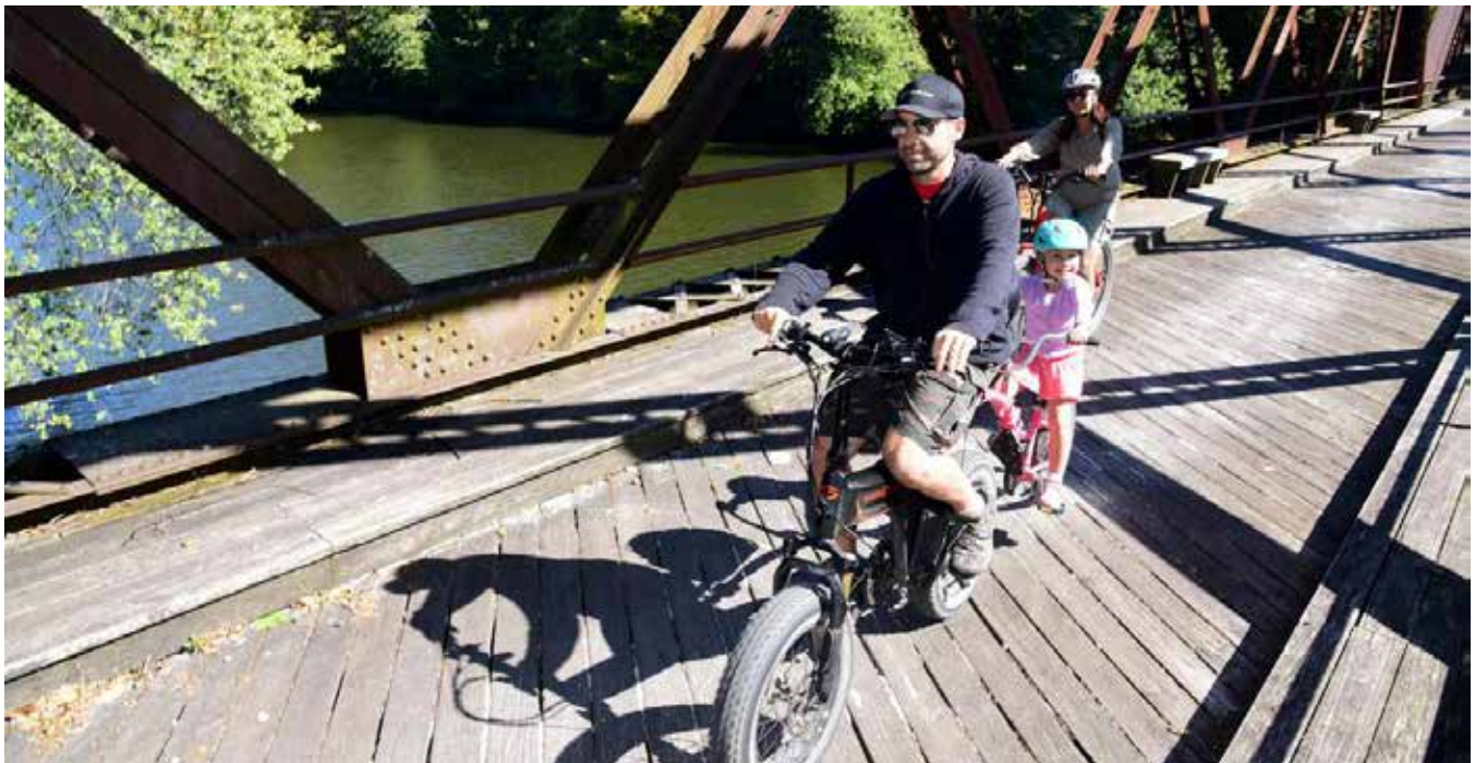
Residents enjoying the Walkill Valley Rail Trail.